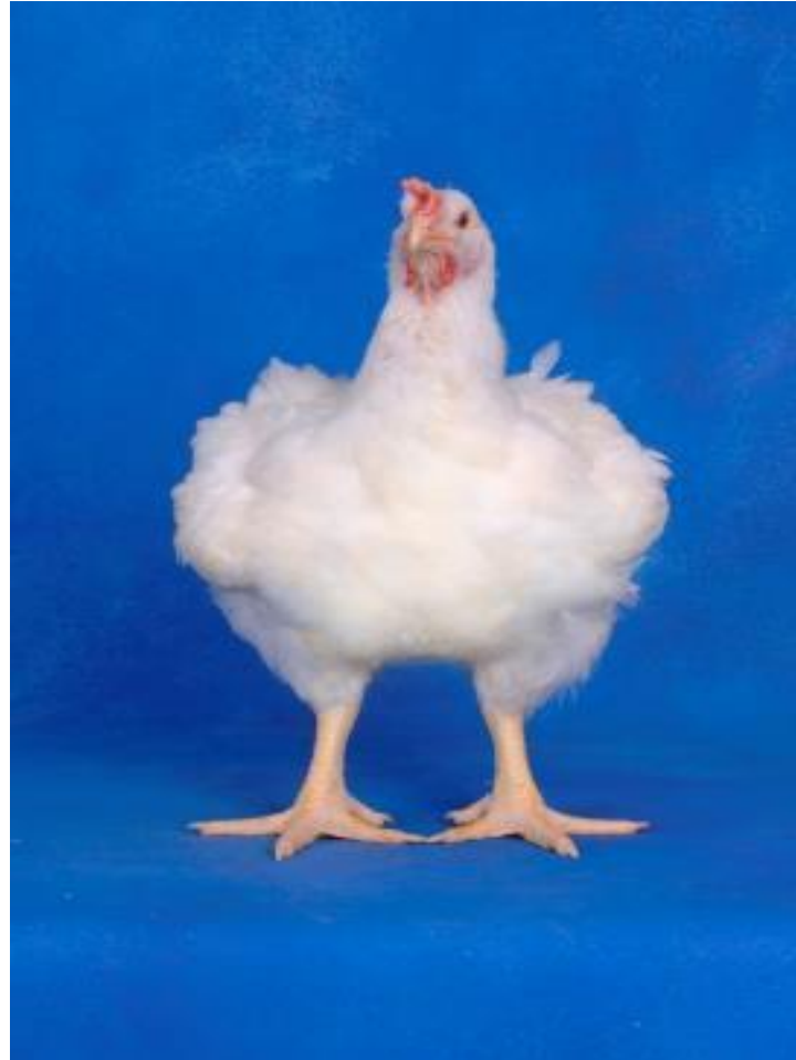
Same age in the eighties and today